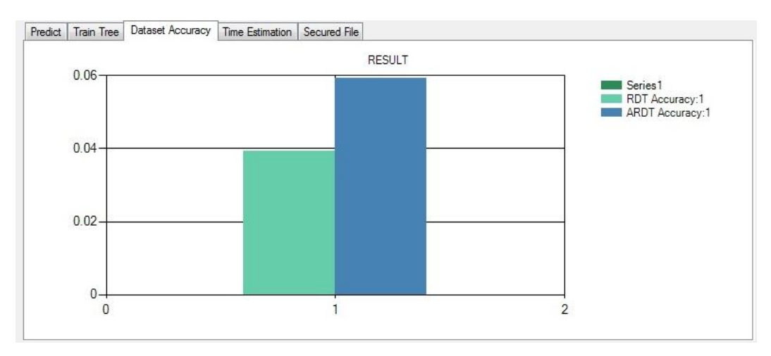
Figure 2: Actual Results (Accuracy)

The proposed ARDT privacy preserving framework using financial market dataset (share market dataset) is in .Net. In this use four company's financial market dataset as test dataset and user dataset i.e. how user invest in share market during that duration as training dataset to generate privacy preserving ARDT. It shows that ARDT privacy preserving provides better accuracy than RDT with privacy preserving framework as shown in fig. 2. It manages distributed dataset effectively by providing better accuracy while preserving privacy of data. It handles distributed data efficiently shown by using different formatted financial market dataset to generate privacy preserving ARDT.