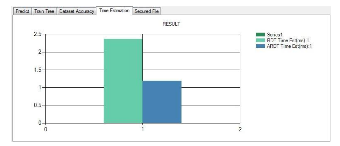
Figure 3: Actual Results (computational time)